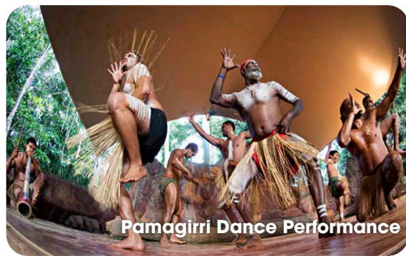
Pamagirri Dance Performance

From 8:40am Travel to Rainforestation Nature Park by coach via the scenic Kuranda Range.