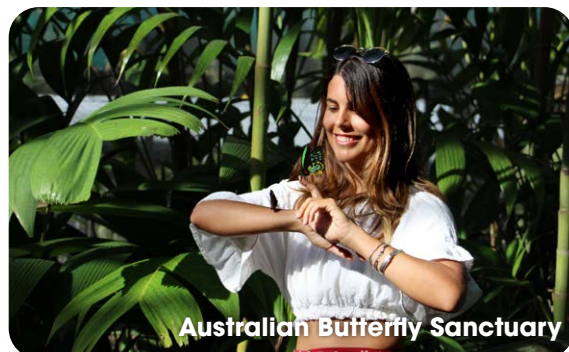
Australian Butterfly Sanctuary

From 12:00pm to 2:00pm Depart Rainforestation for your transfer into Kuranda Village. CHECK BACK PAGE FOR SHUTTLE TIMETABLE. Alternatively, you may wish to stay longer at Rainforestation. Hot lunch is available at the Rainforest Café.