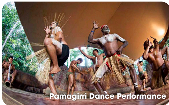
Pamagirri Dance Performance

From 12:45pm Depart Rainforestation for your transfer into Kuranda Village. Alternatively, you may wish to stay longer at Rainforestation, hot lunch is available at the Rainforest Café.