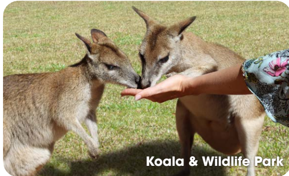
Koala & Wildlife Park

LOCALLY OWNED AND OPERATED BY THE WOODWARD FAMILY SINCE 1981