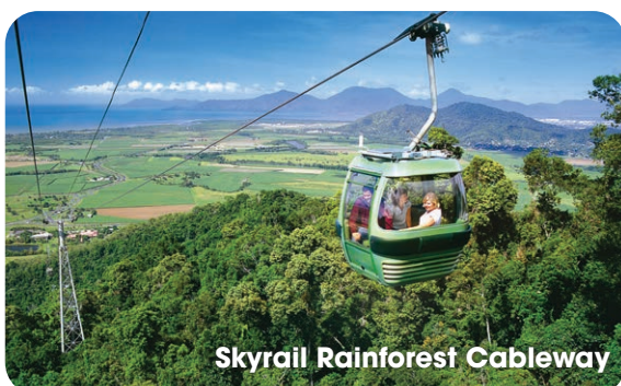
Skyrail Rainforest Cableway

3:30pm Be at Skyrail Rainforest Cableway Kuranda Terminal for 3:45pm boarding. The 7.5km Skyrail journey takes 30 – 40 minutes, however we recommend you spend time at the two stations enroute: Red Peak Station and Barron Falls Station. Ensure you download Skyrail's multi-lingual Interpretive App and Audio Guide from the App Store or Google Play.