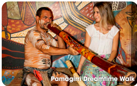
Pamagirri Dreamtime Walk

From 8:40am Travel to Rainforestation Nature Park by coach via the scenic Kuranda Range.