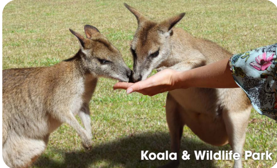
Koala & Wildlife Park

LOCALLY OWNED AND OPERATED BY THE WOODWARD FAMILY SINCE 1981