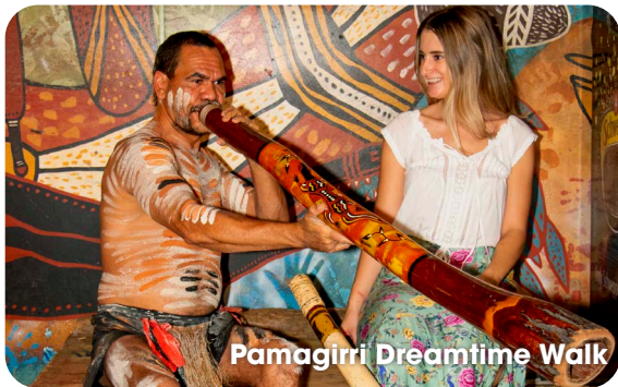
Pamagirri Dreamtime Walk

Travel to Rainforestation Nature Park by coach via the scenic Kuranda Range.