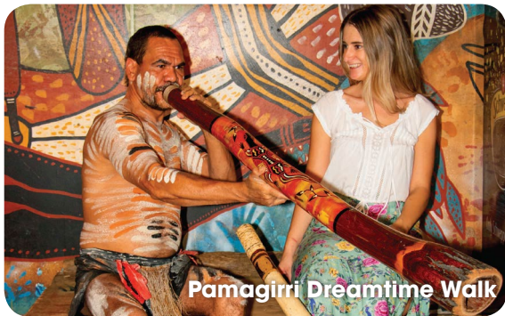
Pamagirri Dreamtime Walk

From 8:40am Travel to Rainforestation Nature Park by coach via the scenic Kuranda Range.