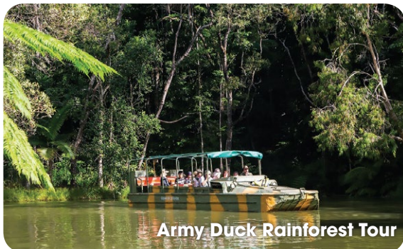
Army Duck Rainforest Tour

On arrival to Kuranda Village, wander through the shops and markets offering local handicrafts, souvenirs and gifts. A must see is the Australian Butterfly Sanctuary with a 10% discount off your entry fee.