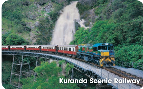
Kuranda Scenic Railway

LOCALLY OWNED AND OPERATED BY THE WOODWARD FAMILY SINCE 1981