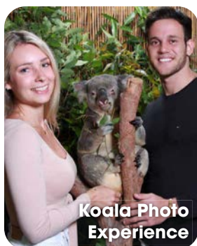
Koala Photo Experience

- Koala & Wildlife Park. Join a guided tour, and see crocodiles, wombats, snakes, dingoes and a cassowary, and hand feed kangaroos and wallabies. You'll have an opportunity to have a photo taken with a koala, or holding a small crocodile (optional extra).