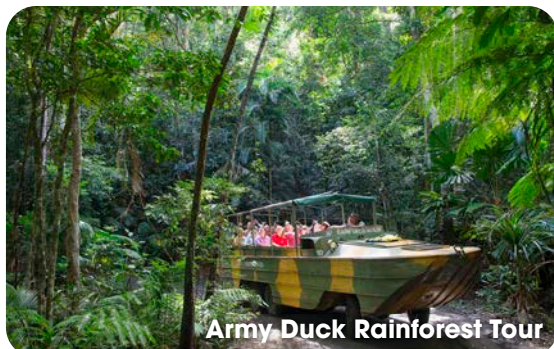
Army Duck Rainforest Tour

Wander through Kuranda Village, the picturesque Village in the Rainforest. A must see is the Australian Butterfly Sanctuary - receive a 10% discount off your entry fee. Marvel at the largest butterfly flight aviary in the country, with a guided tour through the landscaped gardens. View hundreds of butterflies including the famous electric blue Ulysses and Australia's largest butterfly, the Cairns Birdwing. Any other entries or expenditures in Kuranda Village are at own expense.