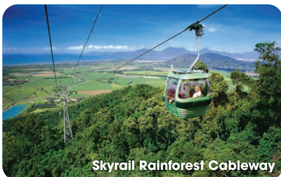
Skyrail Rainforest Cableway

3:45pm Transfer to Kuranda Skyrail Rainforest Cableway Terminal for 4pm boarding. The 7.5km Skyrail journey takes 30 - 40 minutes, however we recommend you spend time at the two stations enroute: Red Peak Station and Barron Falls Station. Ensure you download Skyrail's multi-lingual Interpretive App and Audio Guide from the App Store or Google Play.